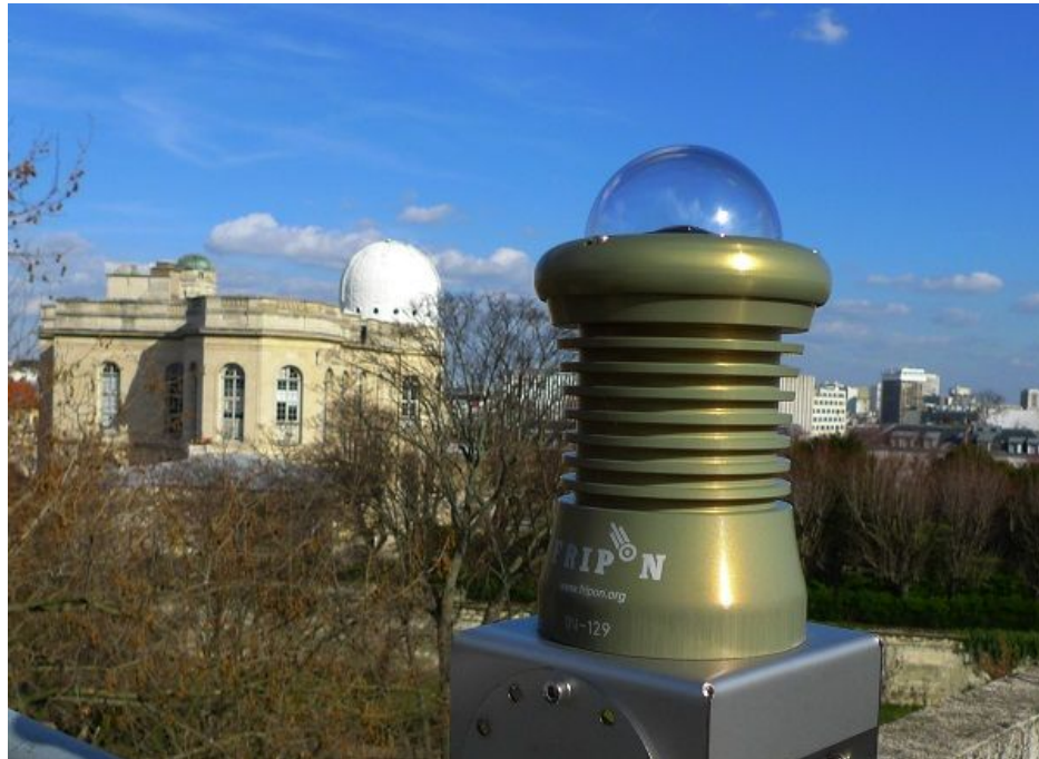
FRIPON camera installed on the roof of the Observatoire de Paris.

In practice, the FRIPON working organization will be taken over in the field by the Vigie-Ciel network, run by the Muséum national d’Histoire naturelle and to be launched in 2017. This citizen science program will make it possible to set up field search parties both quickly and efficiently, with the help of volunteers who will have previously been trained in the framework of Vigie-Ciel.